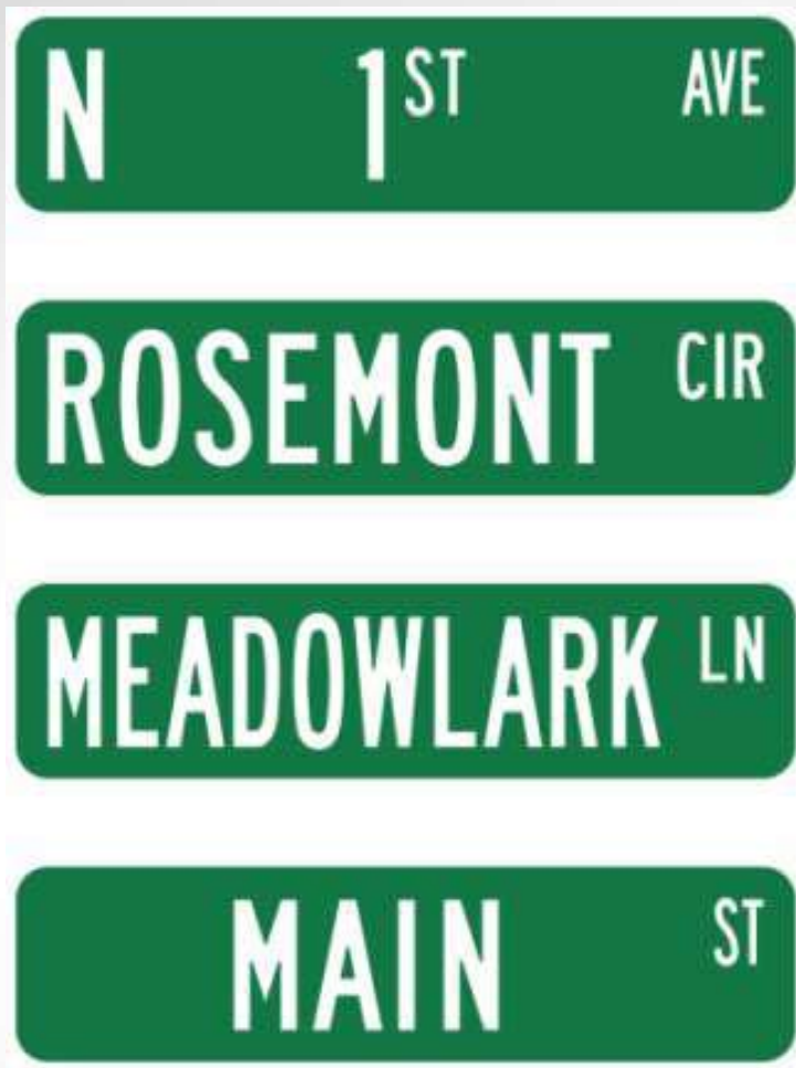
24" x 6" Signs