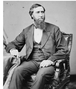
Dakota Territorial Governor Nehemiah Ordway.

On February 8, 1881, Territorial Governor Nehemiah Ordway approved a bill passed by the fourteenth session of the Territorial Legislative Assembly providing for the location and government of a territorial penitentiary. The bill provided that the institution would be located on a track of land not less than 80 acres within the corporate limits of the village of Sioux Falls, Minnehaha County, Dakota Territory. If a suitable tract of land could not be obtained within the limits of Sioux Falls, then the penitentiary was to be located on a tract of land within a one-mile radius of Sioux Falls.