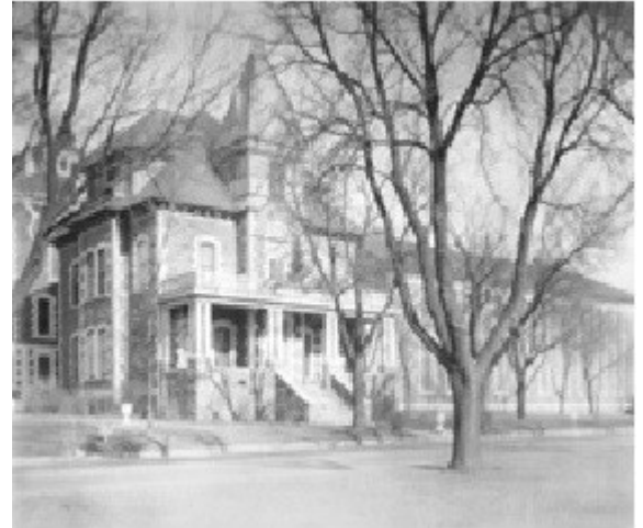
A view of the Warden's House from North Drive.

That building is now used as offices for the Board of Pardons and Paroles, Central Records, Classification and Transfers.